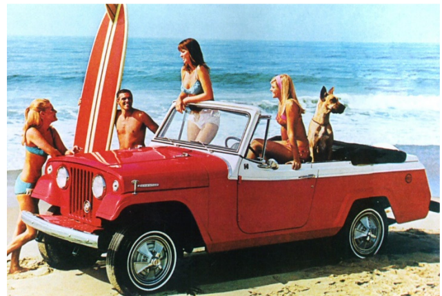
Jeepster Commando built from 1966 - 1972