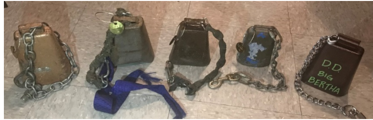
From left to right cowbell 1, 2, 3, 4 and 5